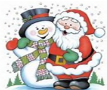
Christmas joy warms the heart

If yes, list the child(ren)'s name(s): _____